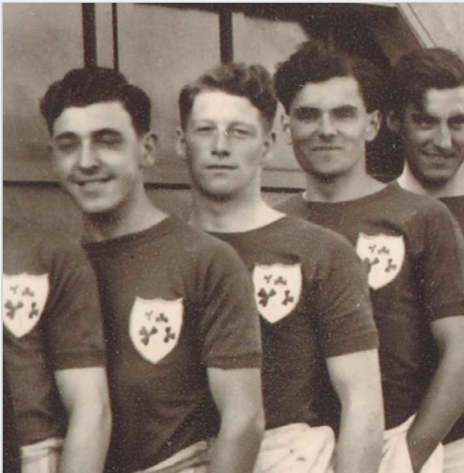
*Pictured second from the left