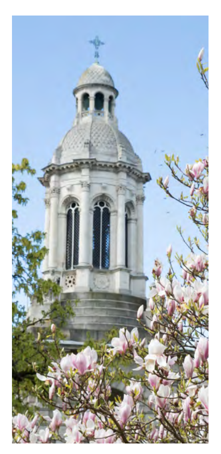
Ireland is the 2nd safest country in the world (Global Peace Index 2024)