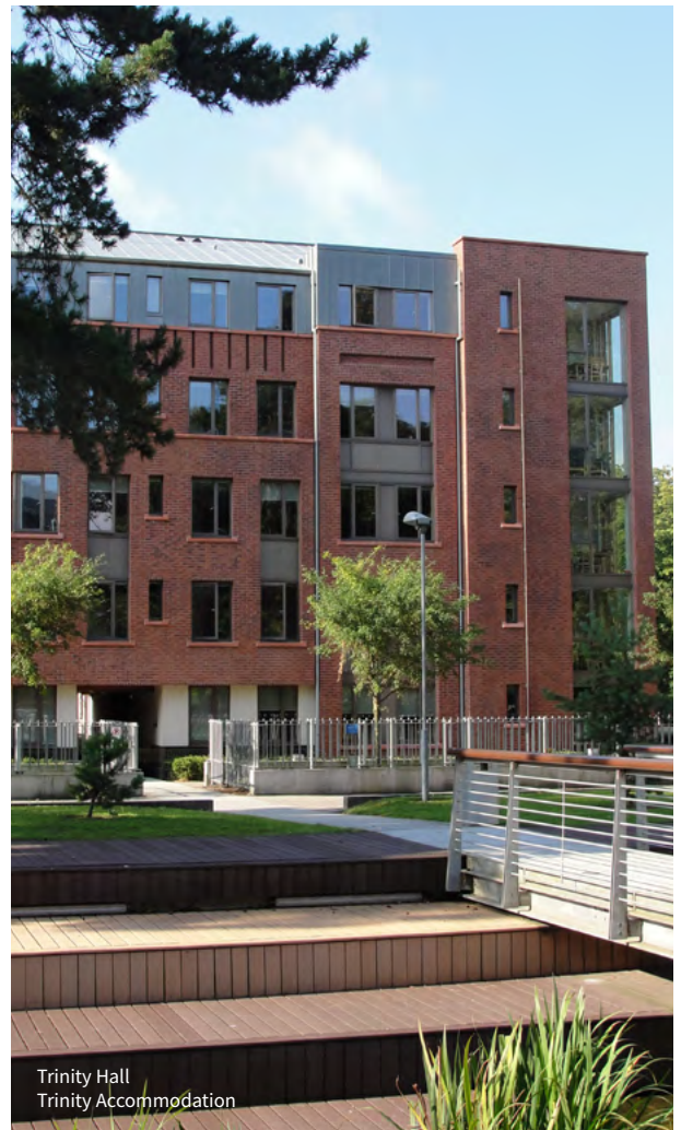
Trinity Hall Trinity Accommodation