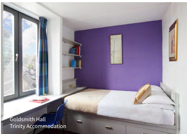
Goldsmith Hall Trinity Accommodation