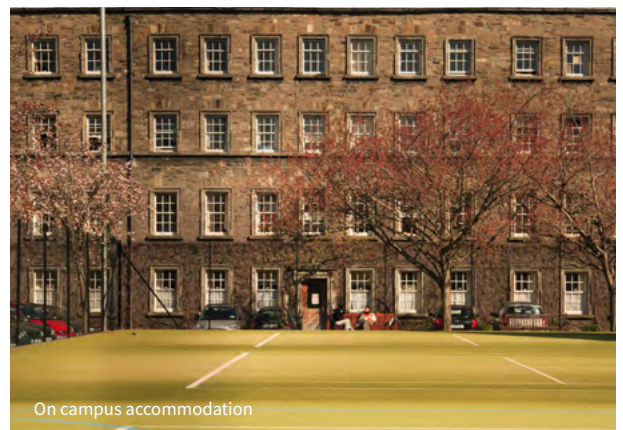
On campus accommodation